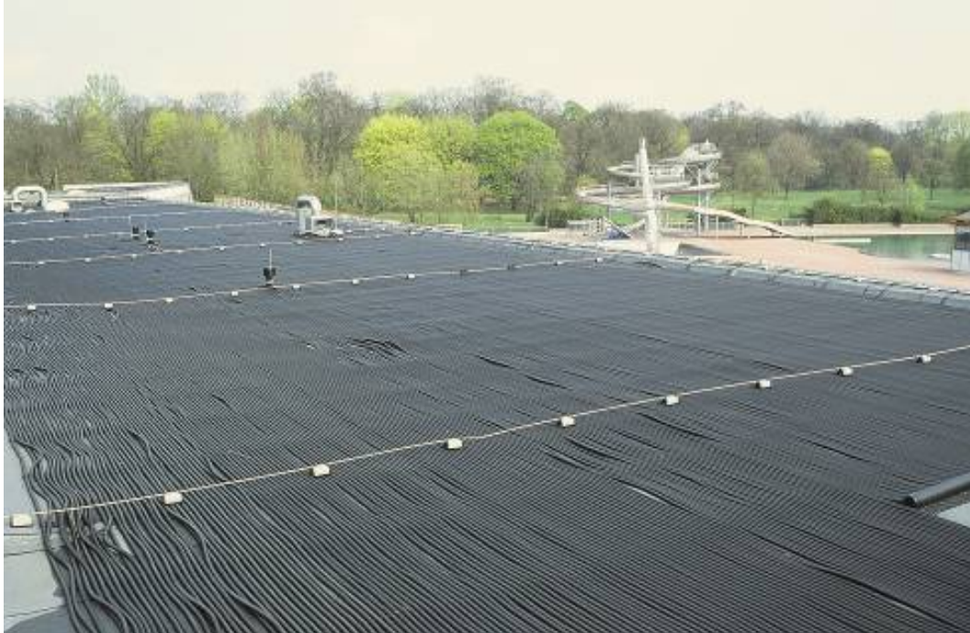
Figure 1: Unglazed collectors open air swimming pool in Berlin-Pankow